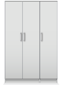
Code Ref: FXCA

Examples below of 2 popular configurations.