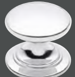
Code Ref: A13