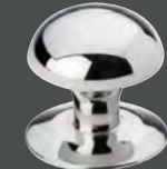
Code Ref: A12