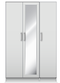
Code ref: FXEA