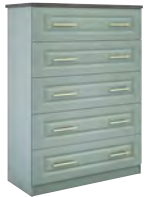
5 DRAWER CHEST