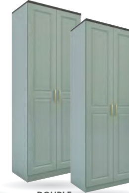
DOUBLE XL ROBE