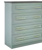
4 DRAWER CHEST