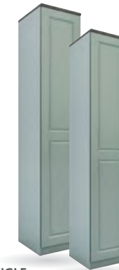
SINGLE XL ROBE