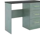
SINGLE DRESSING TABLE