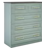
3 + 2 DRAWER CHEST