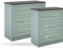
3 DRAWER CHEST