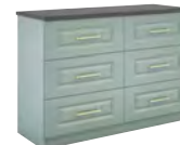
6 DRAWER TWIN CHEST